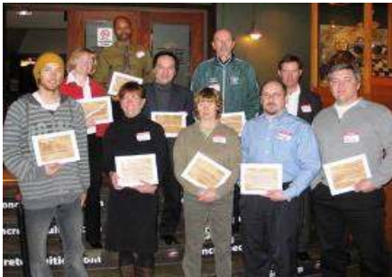
2008 Grant Recipients