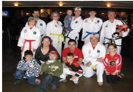
Tecumseh Tai Kwon Do Club