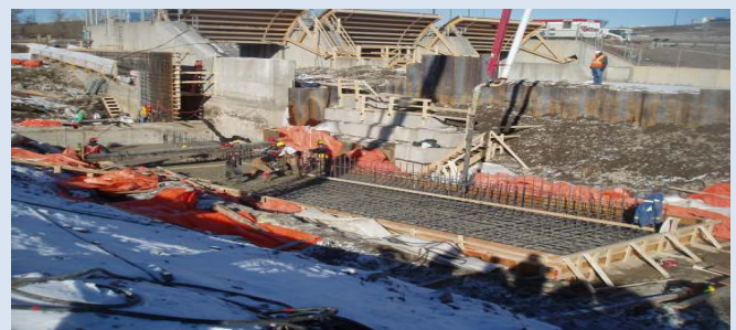
Rendering of finished weir; Construction crews work on foundation next to the weir.